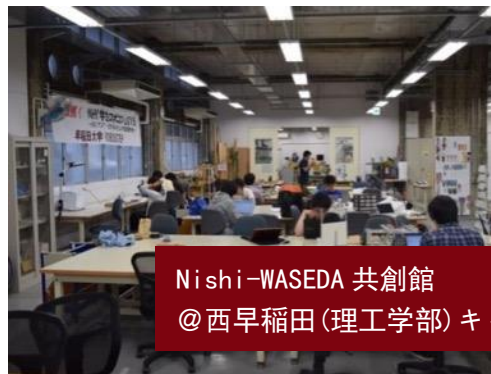
Nishi-WASEDA 共創館 @西早稻田(理工学部)キャンパス